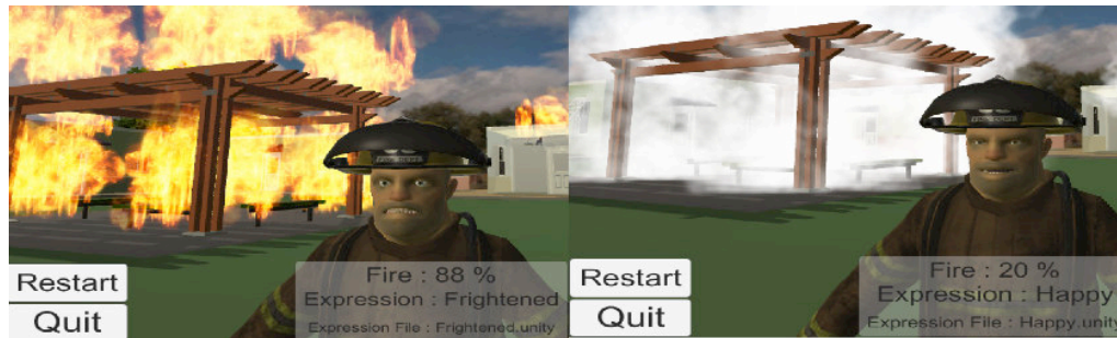
Figure 2. Fire scenario Implementation

the cloud-based virtual environment layer, (3) The client-side 3D player.